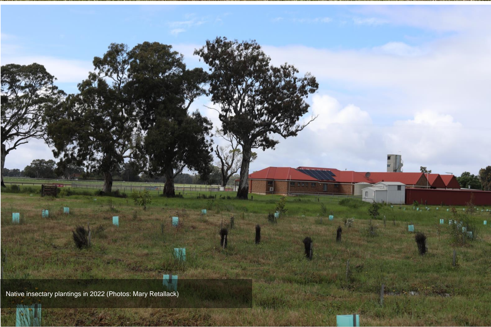
Native insectary plantings in 2022