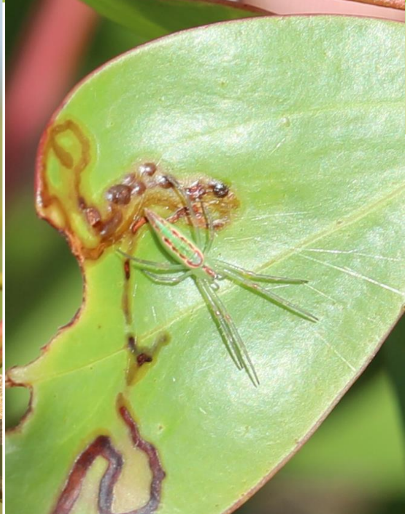
Clockwise from above: four-spotted cup moth, Doratifera quadriguttata , green orb-weaver spider, Araneus talipedatus , garden orb weaver spider, Hortophora transmarina and transverse ladybird beetle, Coccinella transversalis