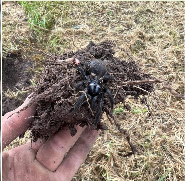
Photo above: Leptospermum lanigerum , woolly tea tree. Photo right: Missulena bradleyi , eastern mouse spider.