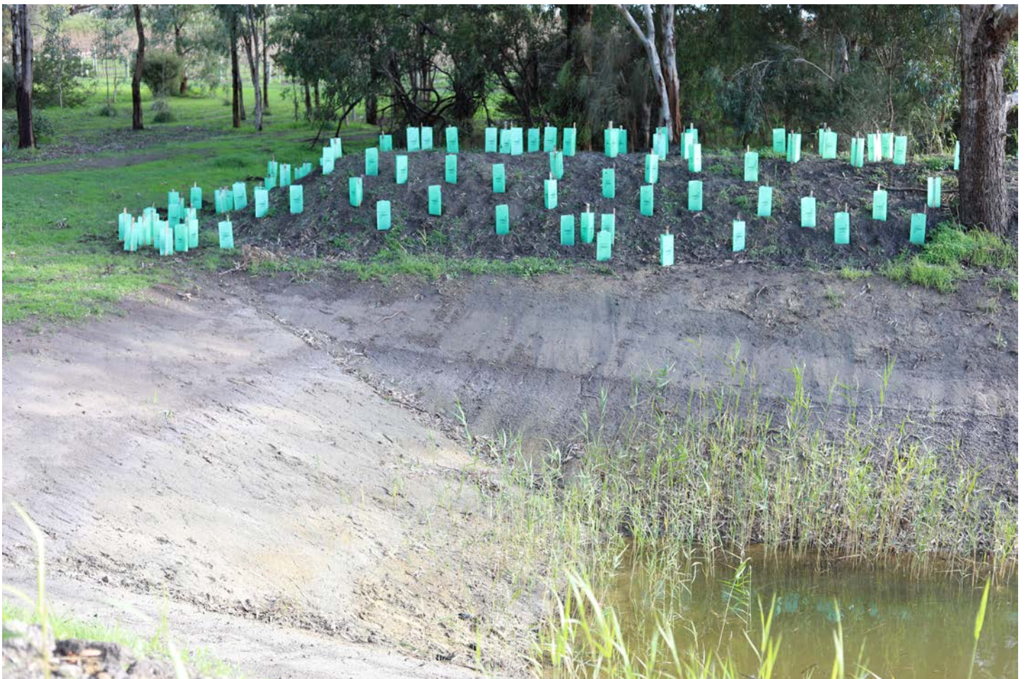
After: 24 June 2020