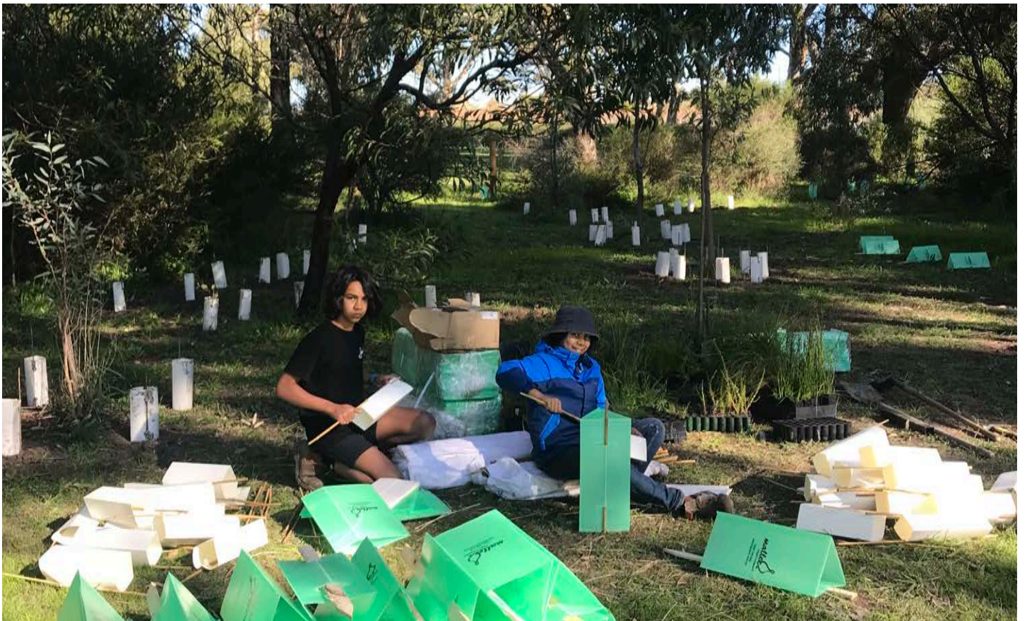
June 2020

This project is supported by the Department of Agriculture, Water and the Environment through funding from Australian Government's National Landcare Program