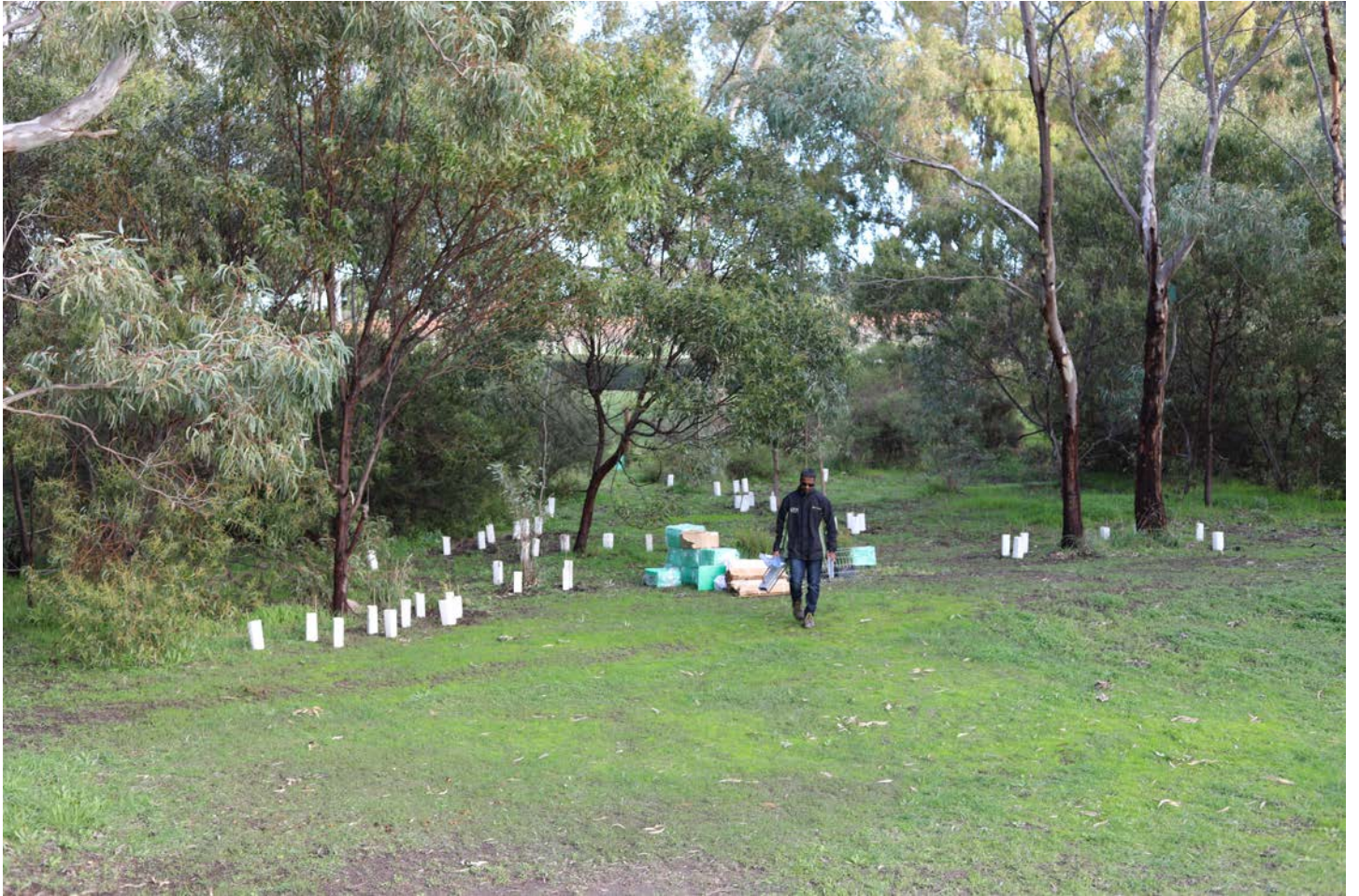
June 2020