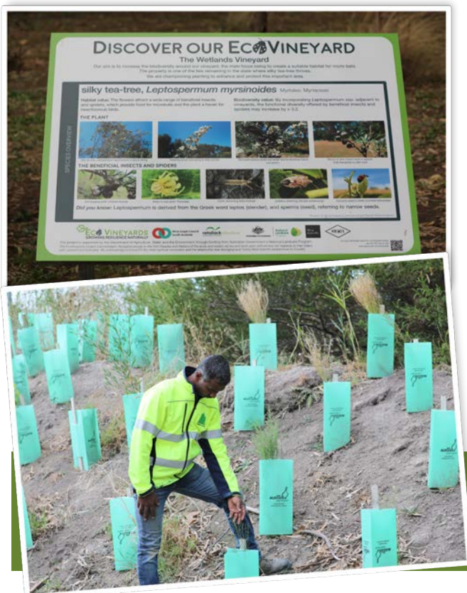
Photo above: Sami Gilligan using an Ocloc photo-point.