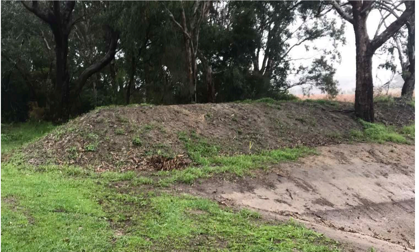
Before: 5 May 2020