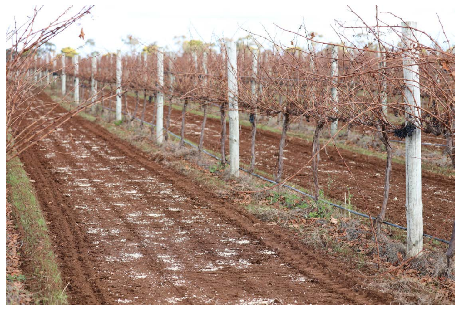
Sowing of native grasses and forbs: 20 May 2021