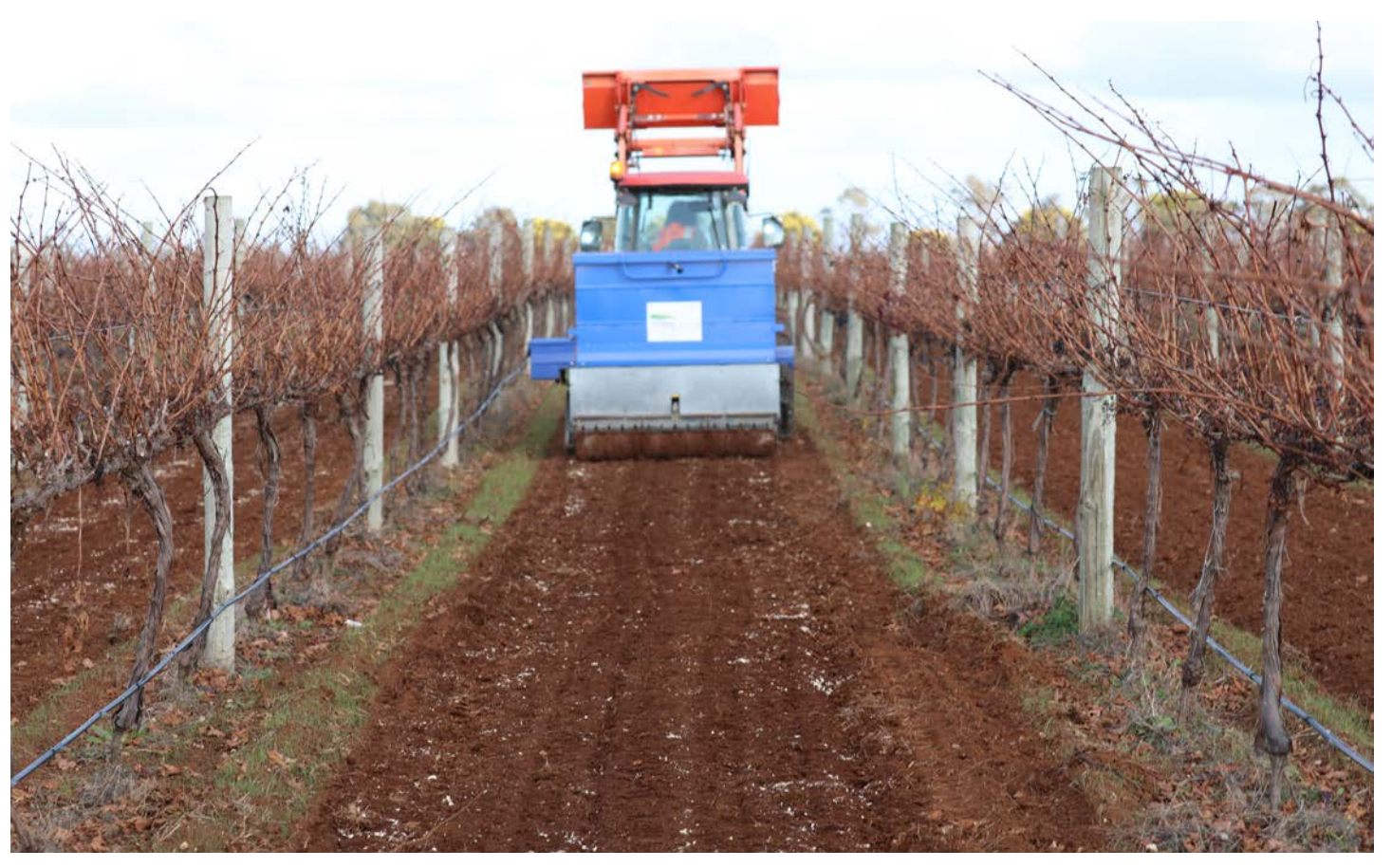
Sowing of native grasses and forbs: 20 May 2021