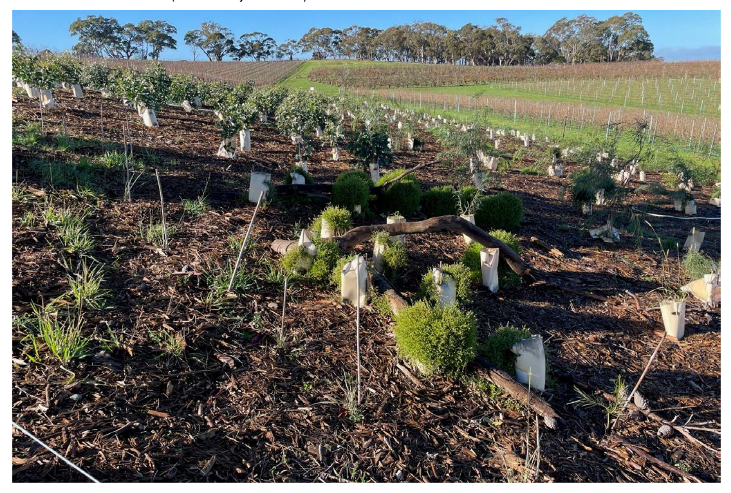
After: 23 June 2022