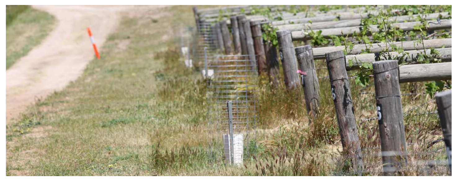
Bursaria spinosa, Christmas Bush or sweet Bursaria planted adjacent to the strainer posts and protected using mallee mesh guards