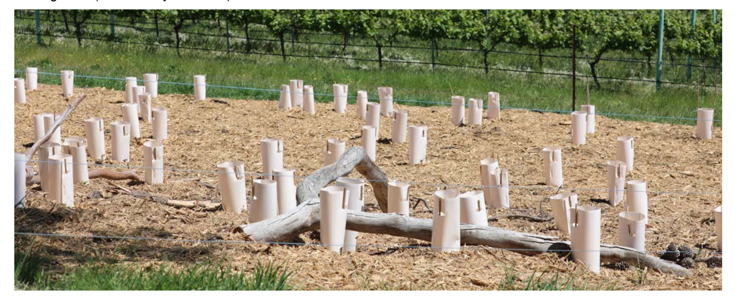
Fallen logs are left in situ amongst the new plantings to provide additional habitat for native fauna