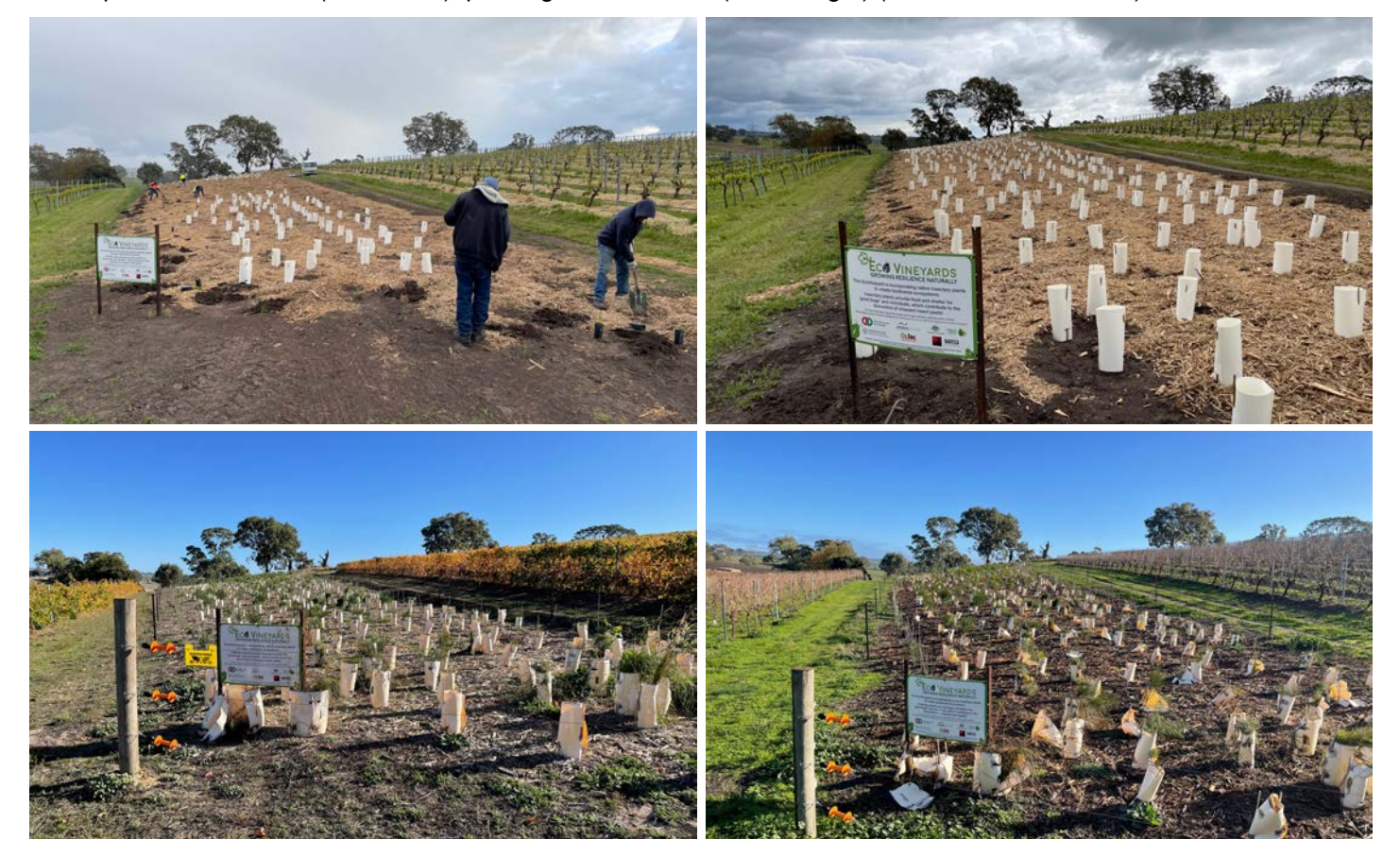
After: View from the photo point – planting and guards on October 2021 (top left), planting complete October 2021 (top right), plant growth May 2021 (bottom left), plant growth June 2021 (bottom right)