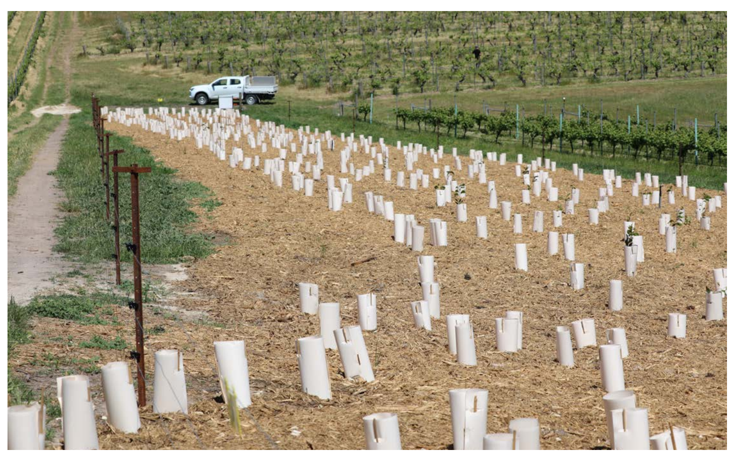
Before: 4 November 2021