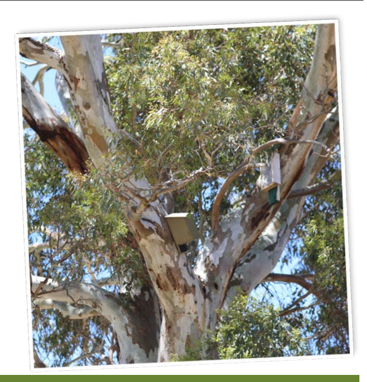
Photo left Raptor perch ready for action (Photo: Mary Retallack). Photo bottom right: Microbat boxes installed to provide additional habitat on site along with tree hollows (Photo: Mary Retallack).