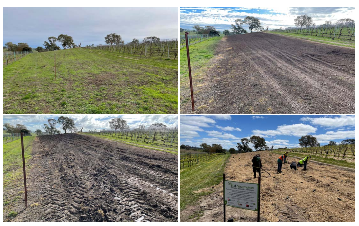
Before: View from the photo point - before preparation June 2021 (top left), compost applied July 2021 (top right), ripping in compost October 2021 (bottom left), planting October 2021 (bottom right)