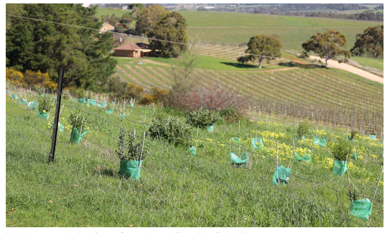
Native insectary planting after: 16 September 2021