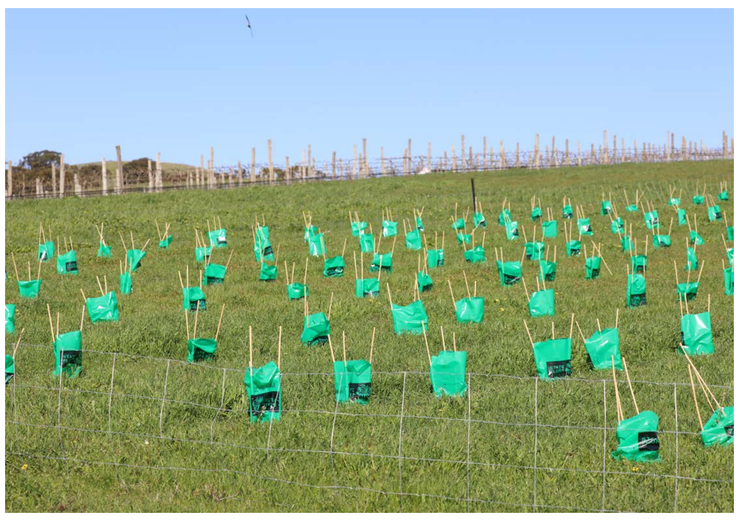
16 September 2021