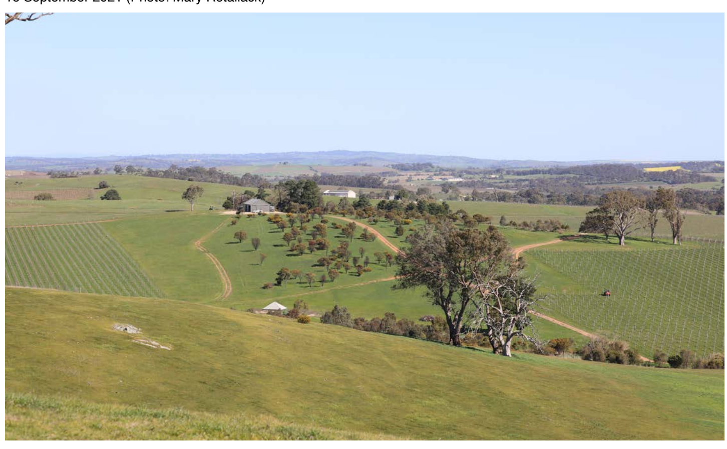
16 September 2021