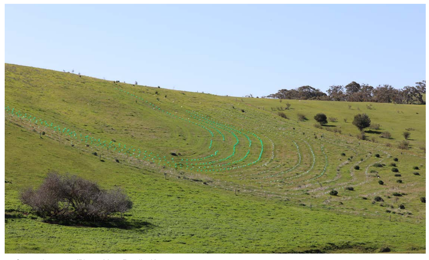
16 September 2021