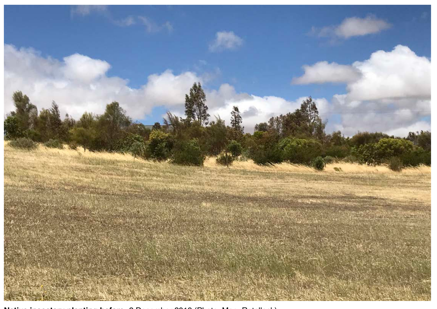
Native insectary planting before: 2 December 2019