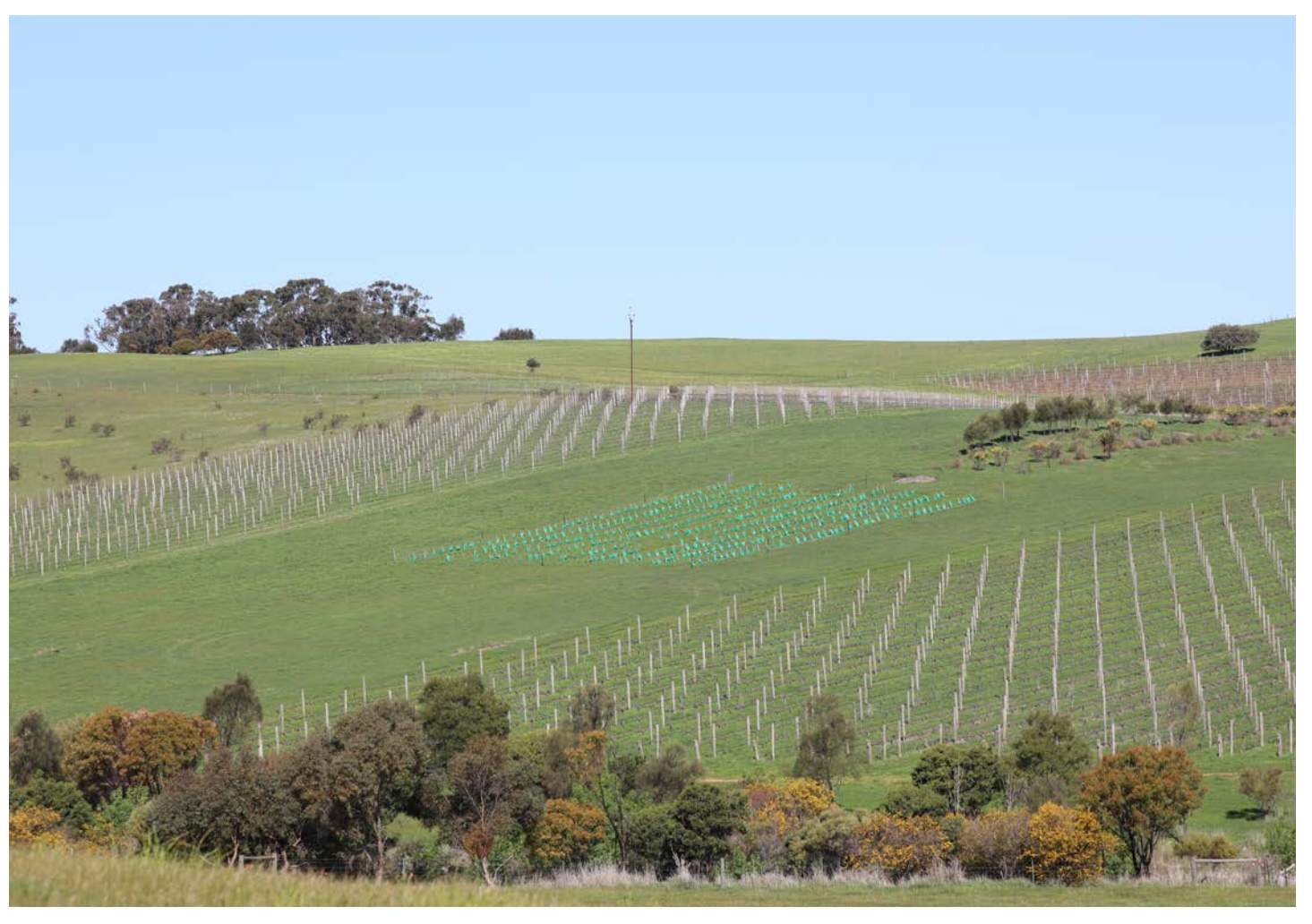
16 September 2021