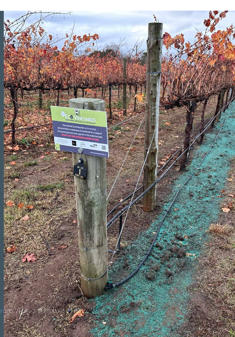
Page 2 • National EcoVineyards Progr

The hydroseeding mix doesn't offer weed suppression but it can aid in erosion control on steep slopes.