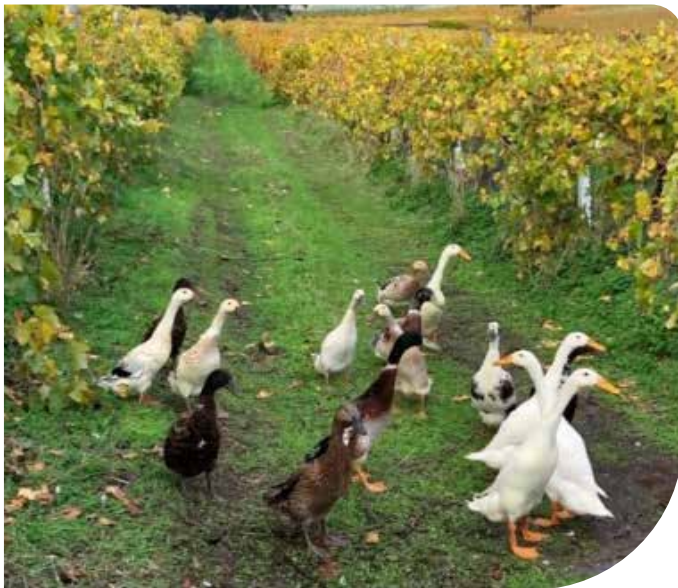
Figure 10: Indian runner ducks in the Angove Vineyard, McLaren Vale.

Encouragement of generalist predators, such as flatworms and nematodes, within the vineyards will help limit snail populations, but will never eliminate snails. Native species of nematode have been found to burrow into snails and release bacteria with mortality >90 % observed in laboratory trials within 10 days of the nematodes being placed with snails, but field validation has not occurred. Two parasitoid fly natural enemies with some potential to limit snail populations are being used in other agricultural systems and are discussed further below.