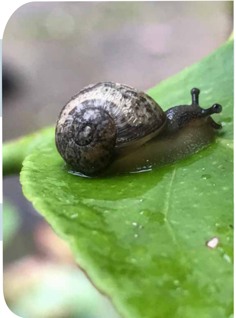
Figure 7: Juvenile Cornu aspersum , common garden snail.

NB: Metaldehyde is the active ingredient in many commercial slug and snail baits and is extremely attractive to dogs due to its palatability and appearance. Signs of metaldehyde toxicosis (e.g., muscle tremors, hyperthermia, seizures) generally appear 1 to 4 hours after ingestion. If left untreated, respiratory failure and death can occur.