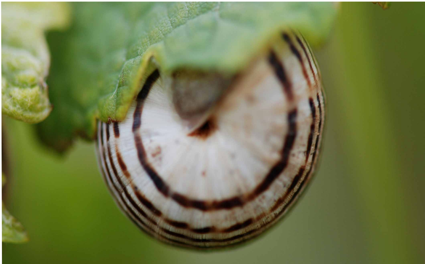
Figure 4: Theba pisana , white Italian snail.

DESCRIPTION: Medium sized round snail whose diameter is < 30 mm, white shell with brown bands that are variable.