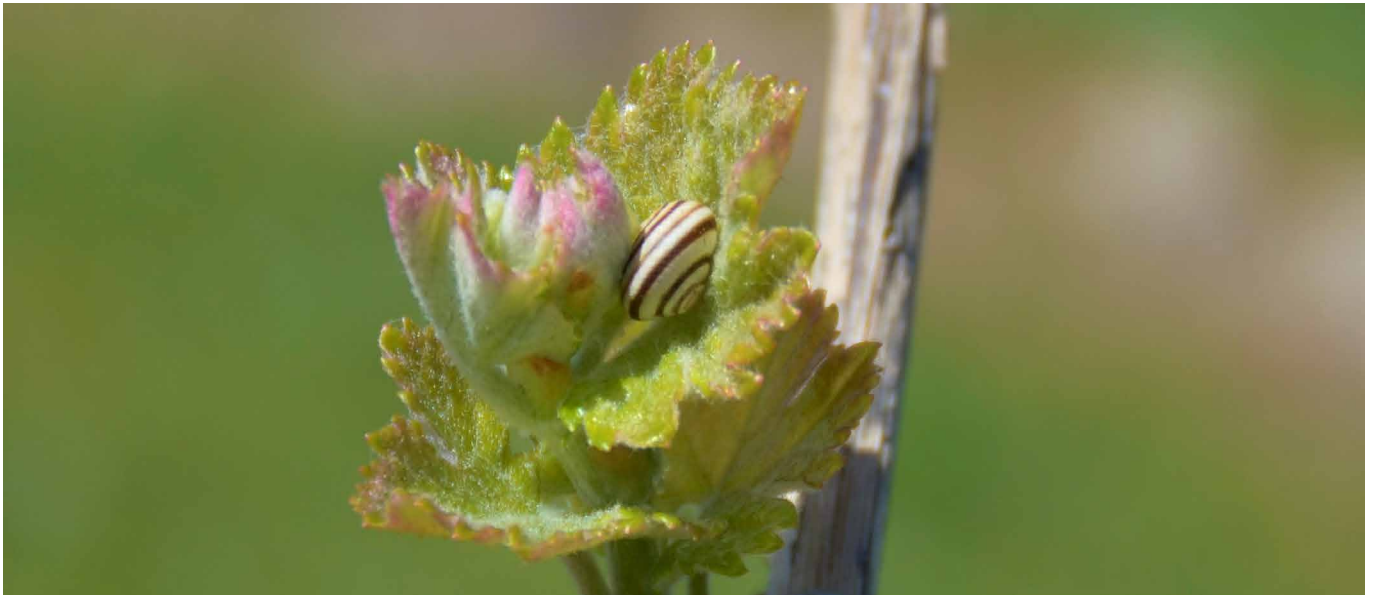
Figure 5: Cernuella spp., vineyard or common white snail.

DESCRIPTION: Medium sized round snail whose shell diameter < 25 mm with 5 to 7 whorls. Often a white shell with broken brown bands but individuals can have no markings. Shell characters are extremely variable. Commonly referred to as Cernuella virgata , recent molecular work would suggest caution when attributing a species name to this group.