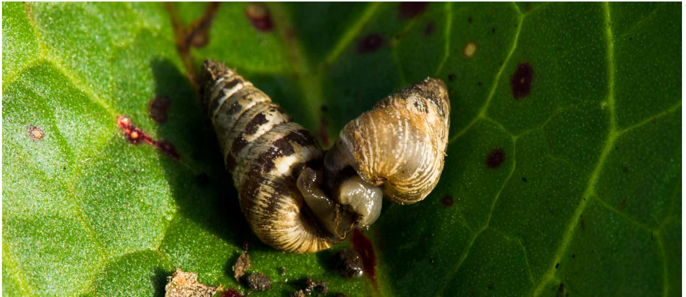
Figure 6: Cochlicella barbara , small conical or small pointed snail mating [Michael A Nash].

DESCRIPTION: A small snail with a conical shell up to 12 mm high and 8 mm wide, with up to eight very slightly convex whorls. The shell colour is variable, ranging from off-white to yellow to grey, and dark-coloured spots or stripes may also be present.