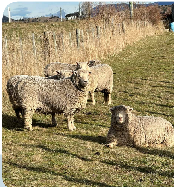
Figure 8: Sheep in the vineyard.

In grazed vineyard blocks, numbers of Italian snails are consistently half those of blocks not grazed.