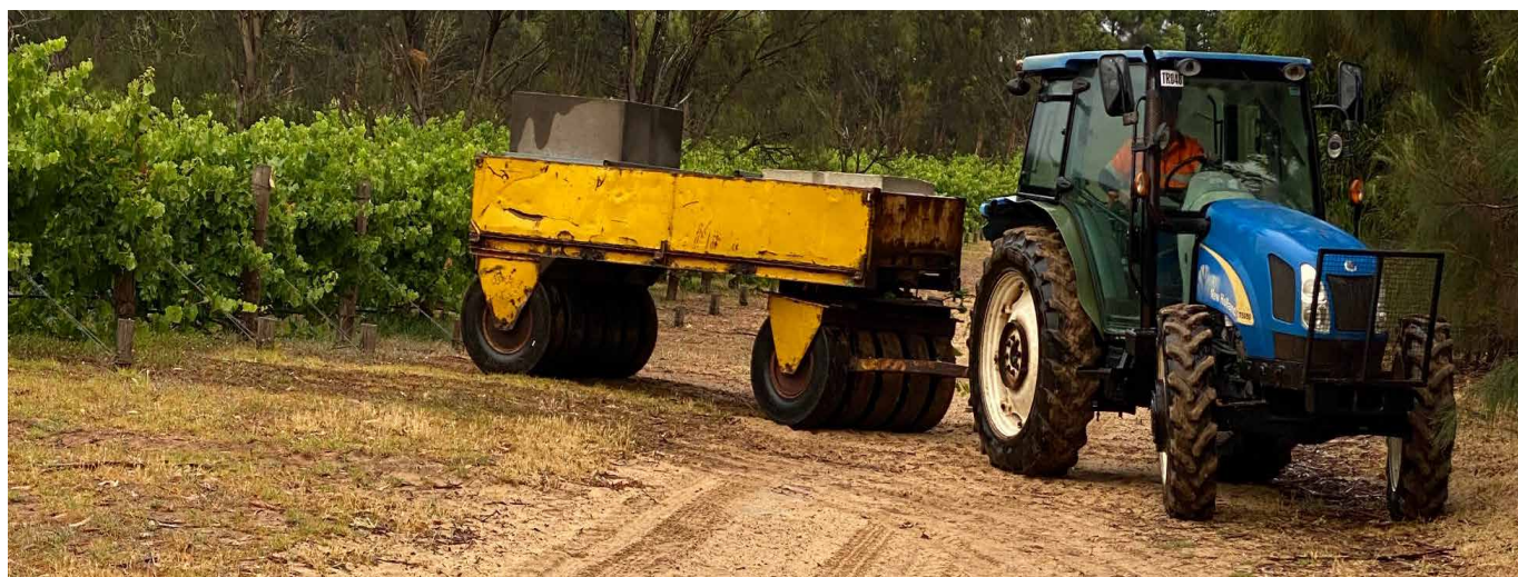
Figure 9: Snail roller used at Guichen Bay and Wrights Bay Vineyards, Mount Benson, SA.

Rolling can be another tool to reduce snail numbers in vineyards.