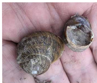
Cornu aspersum common garden snail

25 to 40 mm, does not have umbilicus (hole at the centre of the shell whorls)