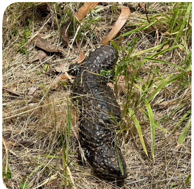
Figure 11: Shingleback lizard, Adelaide Hills, South Australia.

Ducks feeding on snails under vines is well suited as a biological control in organic viticulture if foxes can be controlled. A suggested stocking rate would be 2 to 5 per ha. Indian runner ducks are a breed of Anas platyrhynchos domesticus , the domestic duck and are commonly used in vineyards to contribute to biocontrol of snails and other molluscs.