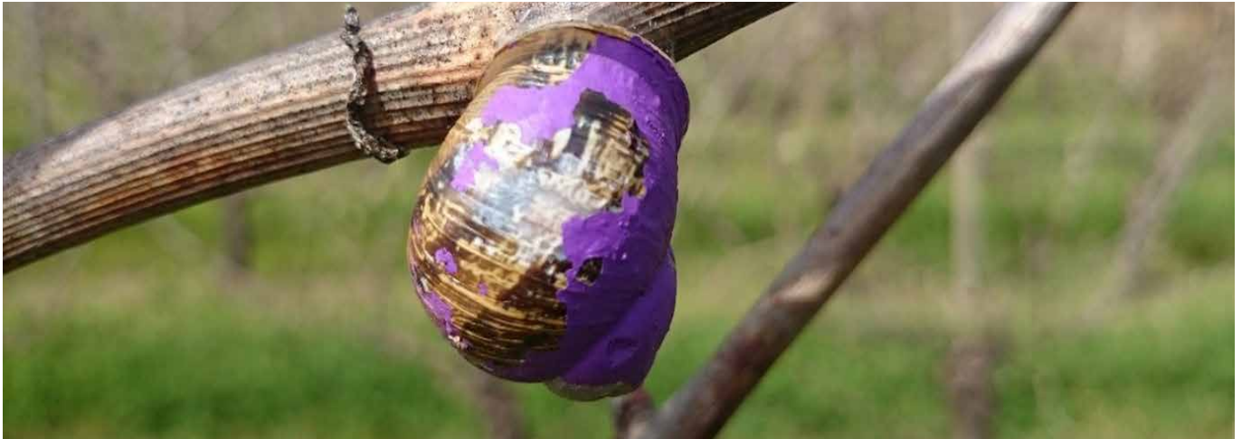
Figure 3: Cornu aspersum , common garden snail marked.

DESCRIPTION: Large round snail with a diameter of < 40 mm and 4 to 5 whorls. Often a reticulated pattern of various shades of brown bands interrupted with yellow streaks. Shell characters are extremely variable.