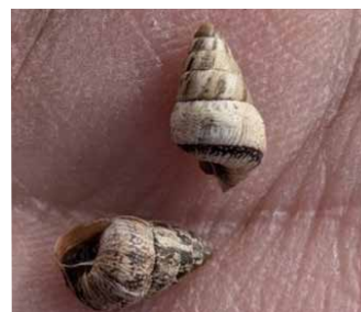
Cochlicella barbara small conical or small pointed snail

Summer torpor in vine canopies, posts and sprinklers or in the ground