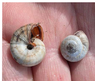
Cernuella spp. vineyard or common white snail