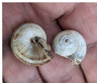
Theba pisana white Italian snail

Winter torpor in the ground and base of vines