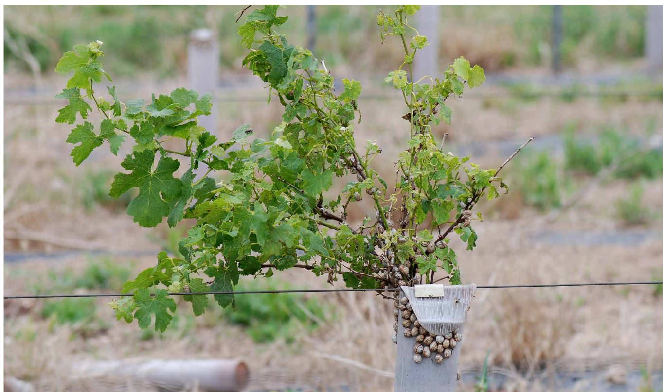
Figure 2: White Italian snails in a vineyard.

Summer torpor under vine bark, moving into sprinklers to hydrate