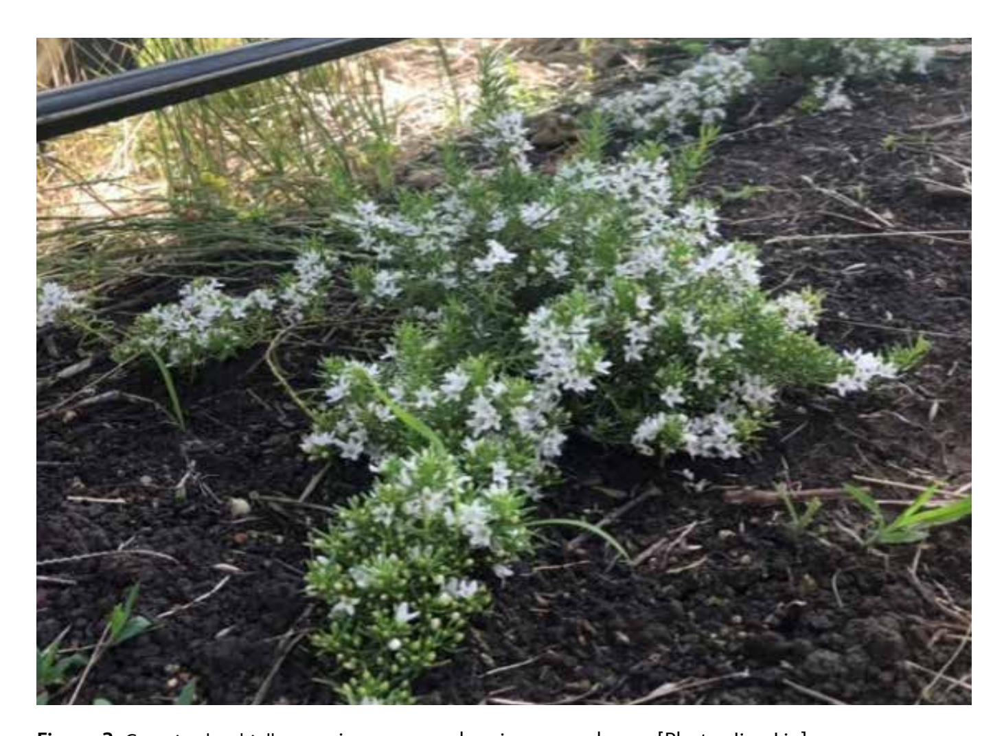
Figure 3. Creeping boobialla growing as an under-vine groundcover.

Myoporum parvifolium, creeping boobialla nectar provides strong benefits to Trichogramma wasps, parasitoids of LBAM and its nectar did not benefit LBAM adults so can be considered one of the safest choices for use in vineyards.