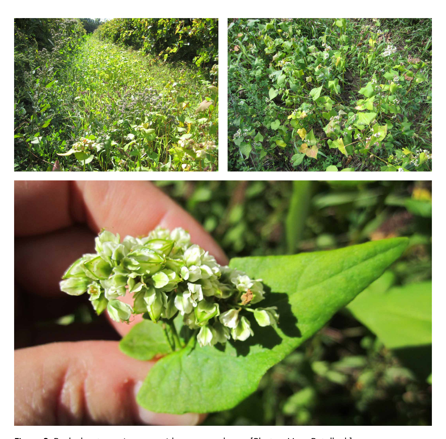
Figure 2. Buckwheat growing as a mid-row groundcover.