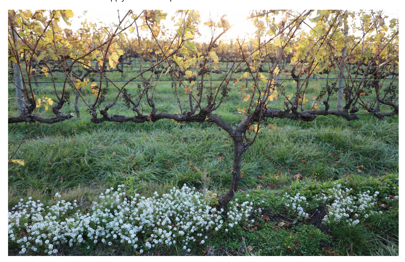
Figure 1. Alyssum growing in the under-vine area in Orange, New South Wales.

In the case of achieving suppression of LBAM, this potentially has a flow-on effect of reducing botrytis. In contrast, if a grower is more concerned with suppressing weed growth and improving airflow to address fungal disease or frost risk, establishing ground covers beneath a larger proportion of the vineyard can be expected to maximise benefit. These observations apply to all three species covered in this fact sheet.