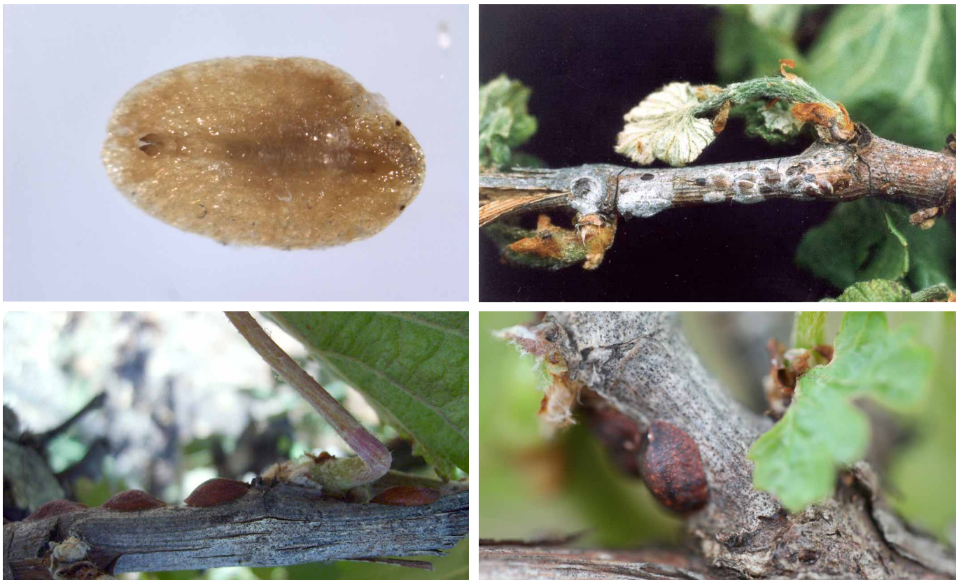
Figure 1. Examples of grapevine scale.

DISTINCTIVE FEATURES: Grapevine scale is a small, oval-shaped, sucking insect up to 6 mm long that lives beneath a protective dark brown wax cover. Grapevine scale produces pink eggs (compared to frosted scale that produces cream-coloured eggs).