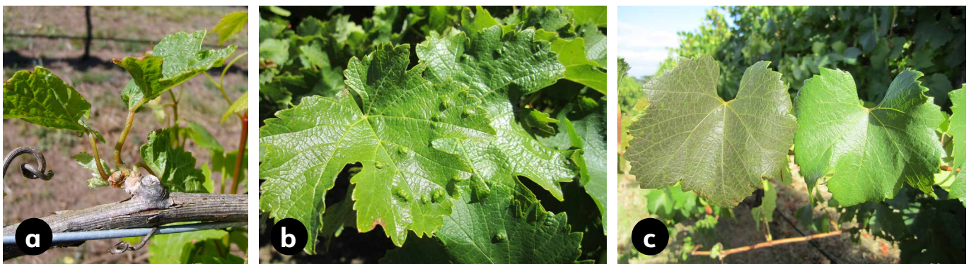
Figure 1. Examples of (a) bud mite damage, (b) blister mite damage, and (c) rust mite damage (L), and a healthy leaf (R).

DISTINCTIVE FEATURES: Rust mites have a hexagonal-shaped head and are bronze in colour. Bud mites look more like a torpedo with a triangular head that is tapered at both ends. The larval stages of both mite species are very hard to distinguish between. The easiest way to distinguish between the species of mites present on grapevines is by the damage they cause. Microscopic magnification is necessary to identify different mite specimens.