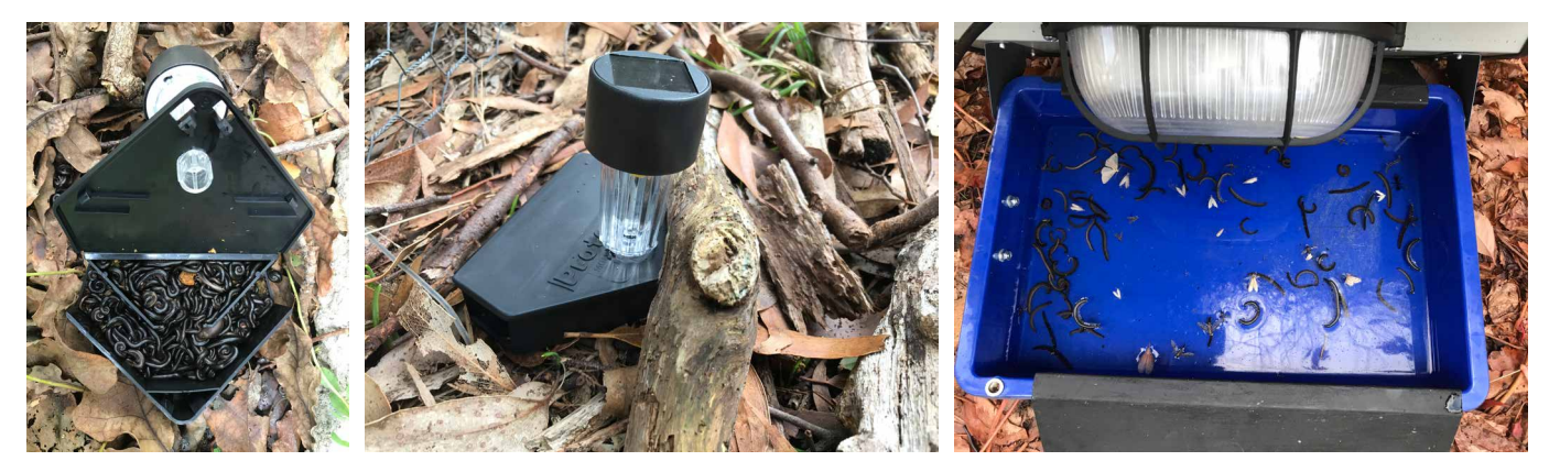
Figure 2. An example of a millipede baiting station, and a light trap with water bath, which can be used to prevent millipedes from invading well-lit dwellings, including a winery.

PARASITIC NEMATODES: It is possible to reduce millipede populations in suburban settings via the release of the parasitic nematode Rhabditis necromena . They are available commercially and are typically distributed using baiting stations. The nematodes are ingested by millipedes and bore through their gut wall lining. Bacteria from the gut then infect millipedes, which kills them (Bailey and Baker, 2016). It may take several seasons after introduction for the nematodes to reduce millipede populations. It may also provide an effective, long-term, biocontrol option for the suppression of millipedes in vineyards. Further research is required to test this.