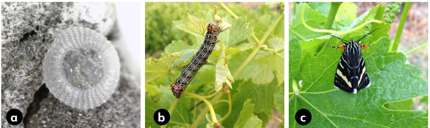
Figure 1. (a) Phalaenoides glyciniae , grapevine moth egg, (b) larva, and (c) adult.

DISTINCTIVE FEATURES: Grapevine moth eggs are commonly laid on the underside of leaves and resemble spherical domes. They are slightly ribbed and have a diameter of about 0.3 mm. The caterpillars grow to about 40 mm. They have striking black, white, yellow, and orange markings with a light brown head capsule and a big red rump. Adult moths have tufts of orange hair projecting from their abdomen and the base of their legs, contrasting with the black and white markings of their wings and body. The wingspan is about 50 mm.