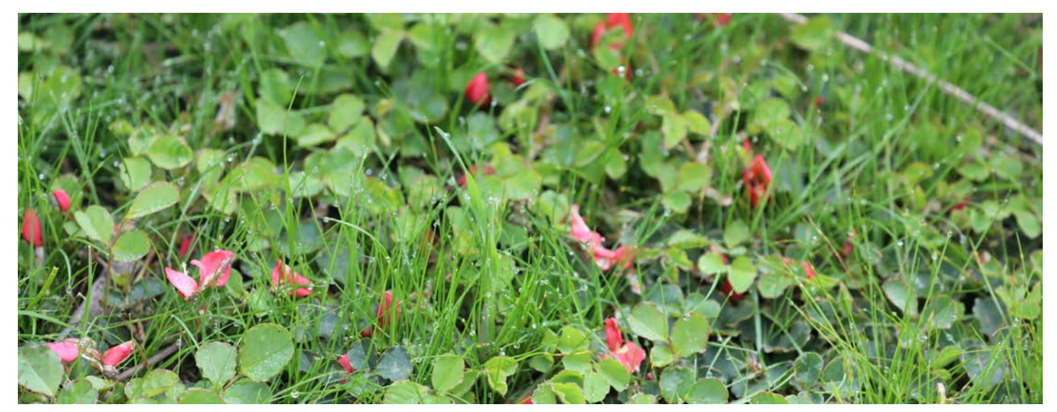
Running postman, Kennedia prostrata in flower - September 2021