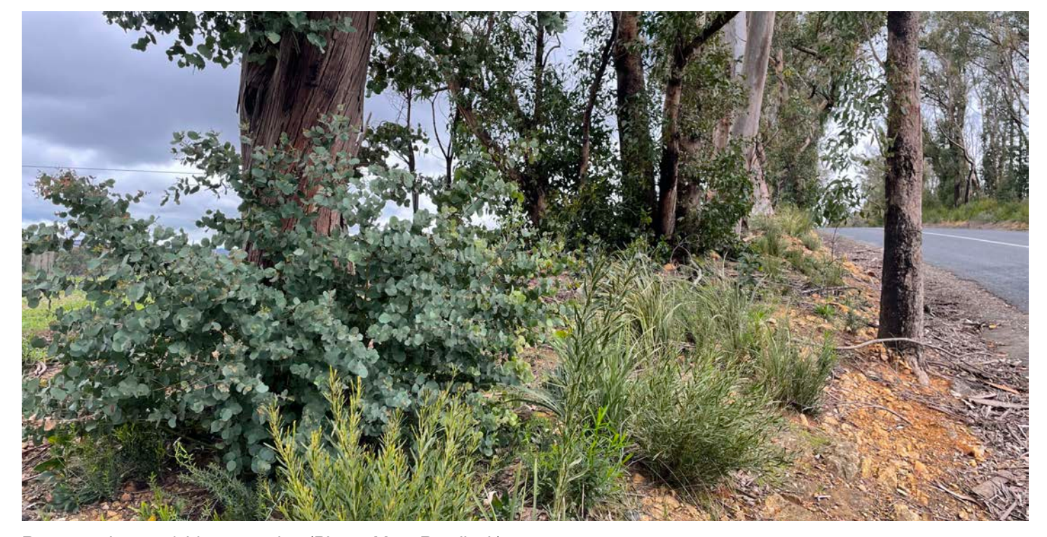
Regenerating roadside vegetation