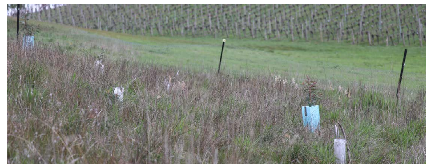
Native insectary plants in establishment adjacent to the vineyard