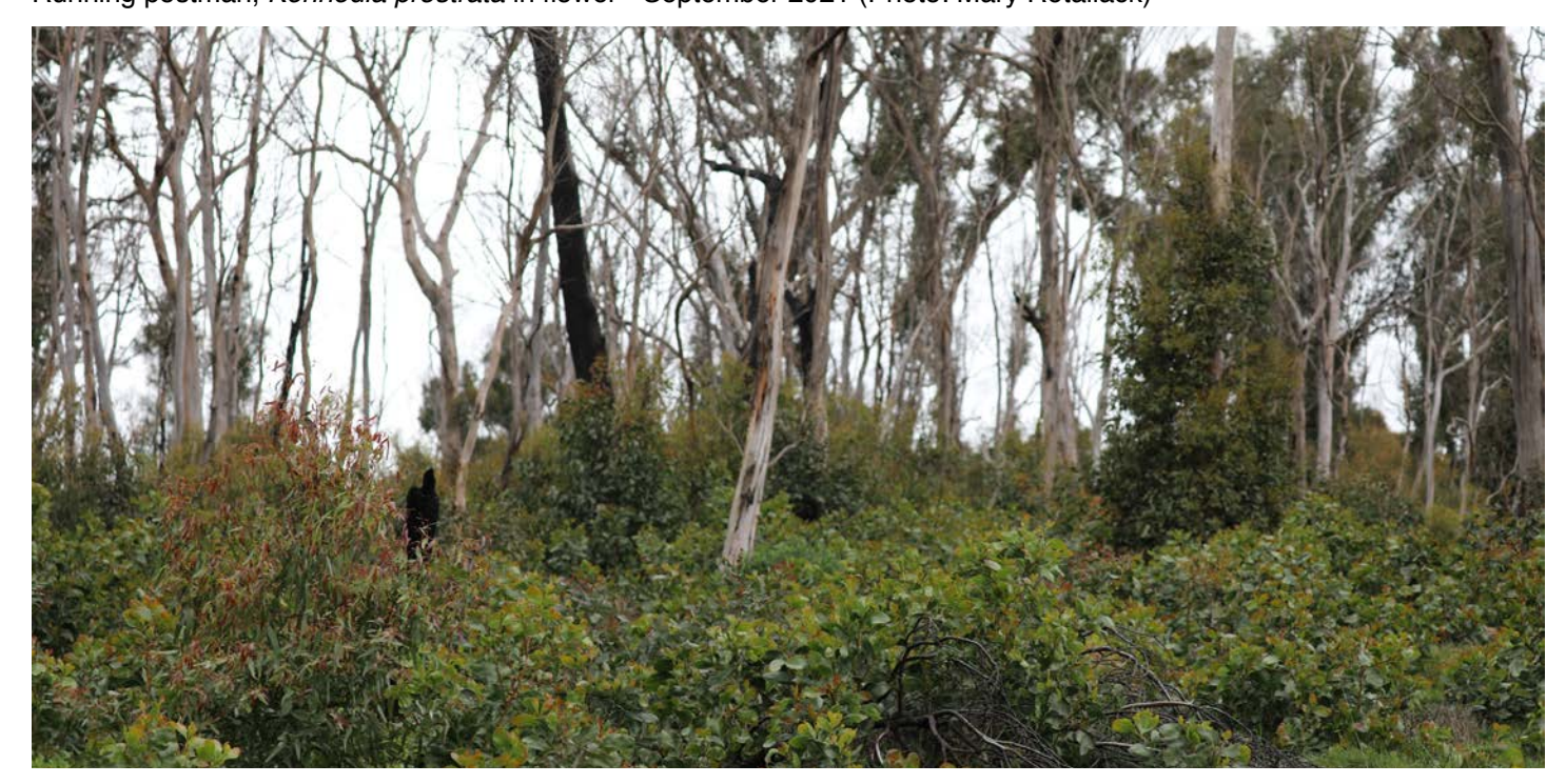
Epicormic growth originating from fire damaged gum trees