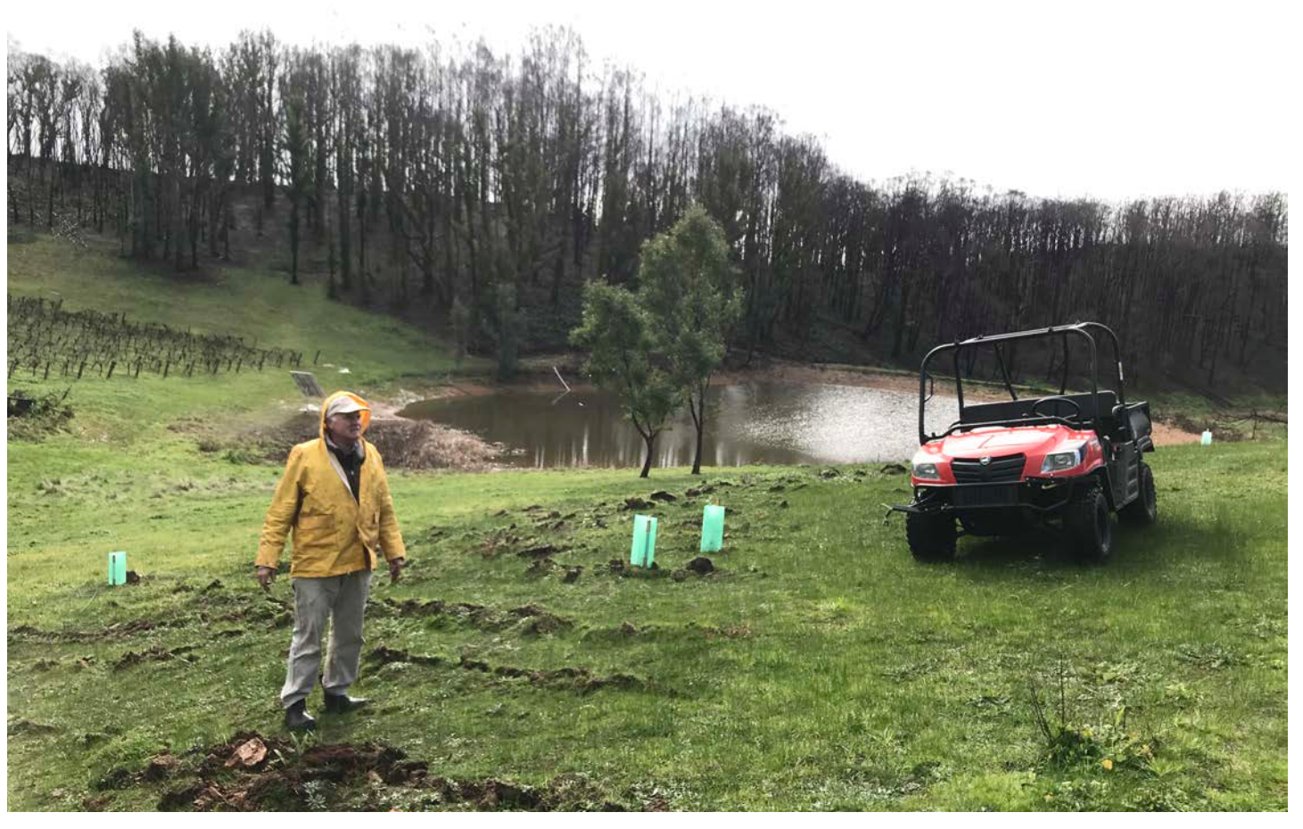
Before: 22 June 2020