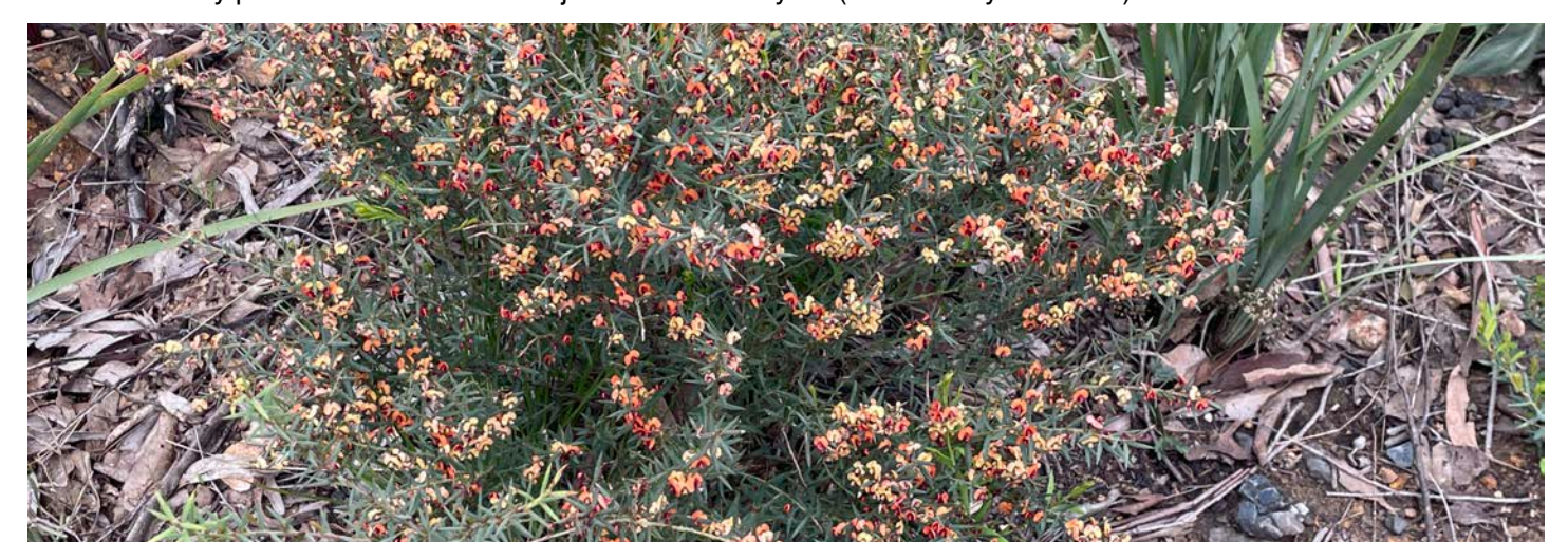
Regenerating roadside vegetation