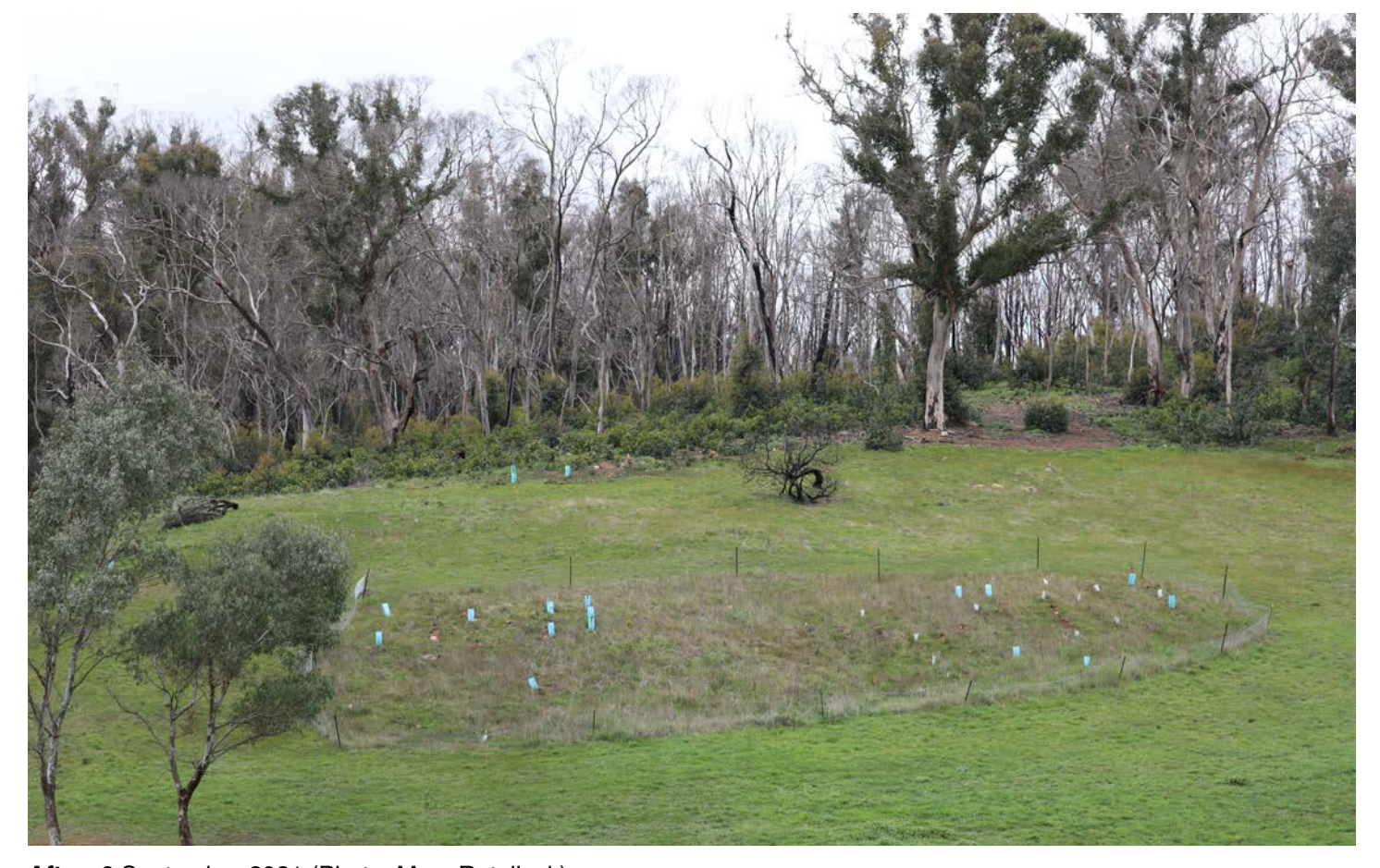
After: 6 September 2021